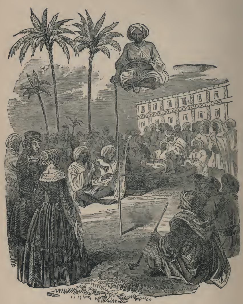
The Madras Brahman who claimed to sit in the air by Yoga powers.