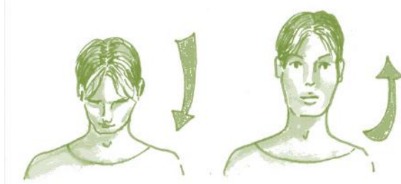
Figure 1 - moving the neck up and down.

Close your eyes and take a deep breath. First, inhale and get ready, then exhale to start the first cycle.